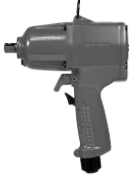
NPW-140 1/2" Sq. Drive Pulse Wrench