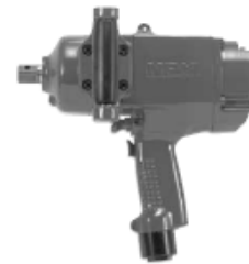
NPW-200T 3/4" Sq. Drive Pulse Wrench