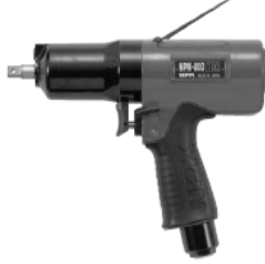
NPW-800B-T00 3/8" Sq. Drive Pulse Wrench