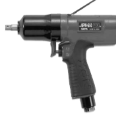
NPW-650A-T00 3/8" Sq. Drive Pulse Wrench