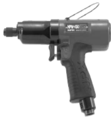
NPW-450A-TDX 1/4" Female Hex Pulse Screwdriver