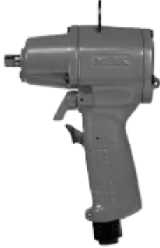
NPW-60 3/8" Sq. Drive Pulse Wrench