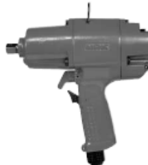
NPW-120T 1/2" Sq. Drive Pulse Wrench