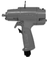
NPW-80T 3/8" Sq. Drive Pulse Wrench