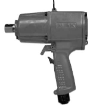
NPW-180 3/4" Sq. Drive Pulse Wrench